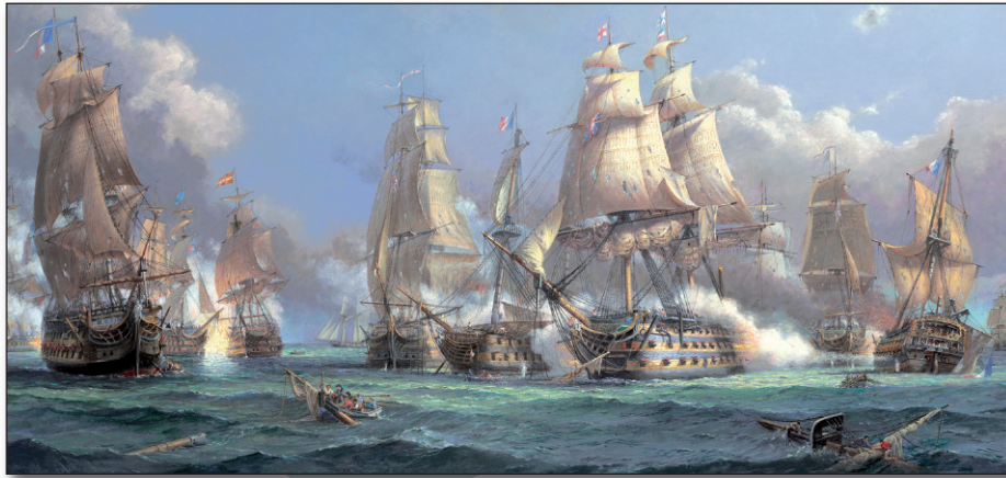
THE BATTLE OF TRAFALGAR – THE DECISIVE ACTION