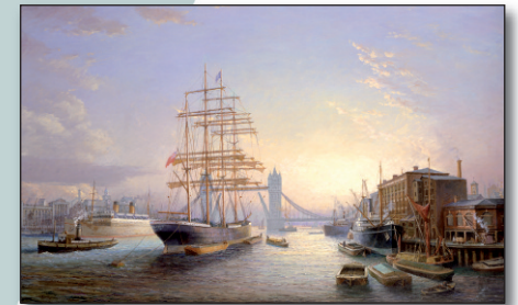
THE WINDJAMMER PASSAT NEAR TOWER BRIDGE CIRCA 1930