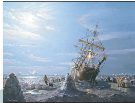
SHACKLETON'S ENDURANCE BESET BY ICE IN THE WEDDEL SEA