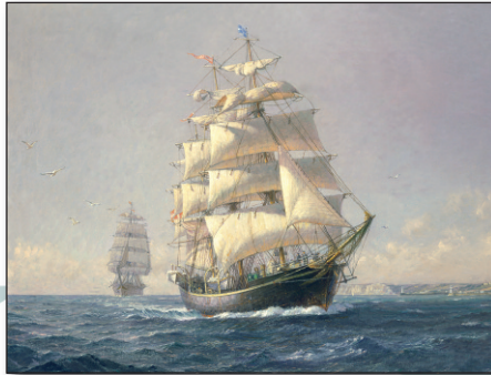
THE GEORG STAGE II, DENMARK