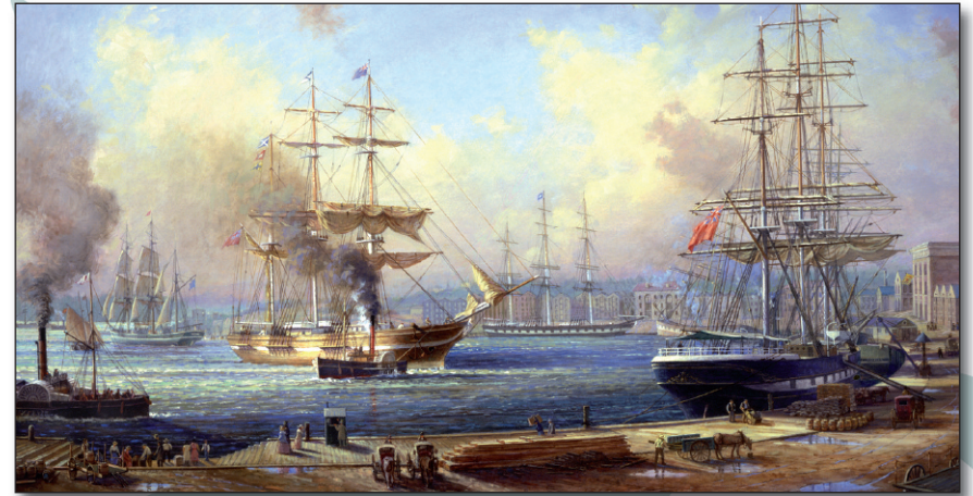
CIRCULAR QUAY, SYDNEY